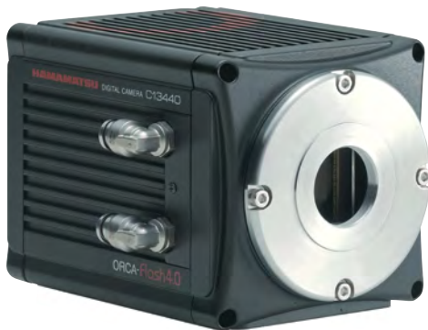
Each ORCA-Flash4.0 V3 is shipped with a mounting baseplate pre-installed.

Like its predecessors, each ORCA-Flash4.0 V3 is capable of both USB 3.0 or Camera Link output. In addition, the ORCA-Flash4.0 V3 offers data reduction through user-controllable look up tables (LUT) for 12 or 8-bit output. These two choices, combined with region of interest selection enable you to fine tune acquisition speed and image data requirements.